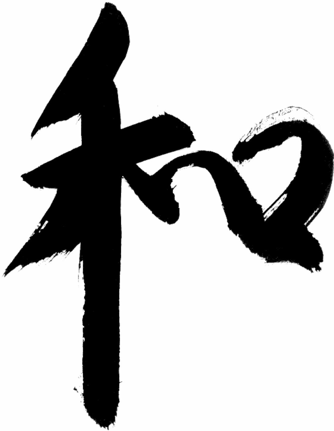
Harmony — Calligraphy by Nonin Chowaney