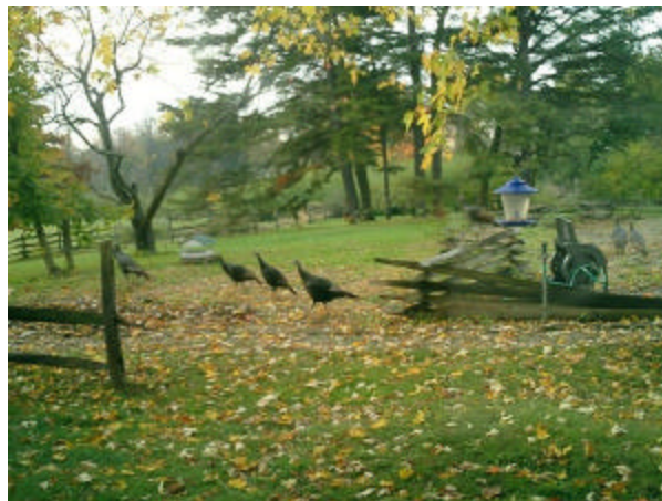
Wild Turkeys at Deep Spring Temple